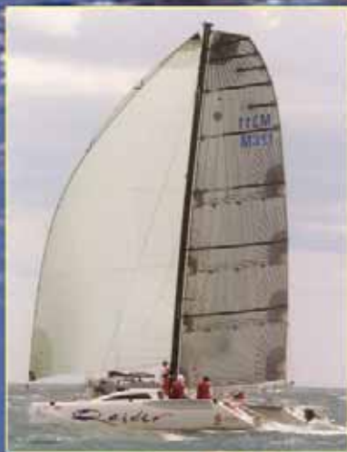
Proud suppliers to the new Raider One Design Boats