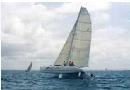
Wins the lot: Flat Chat winner of 2002 Line Honours, POHS, OMR. (above)