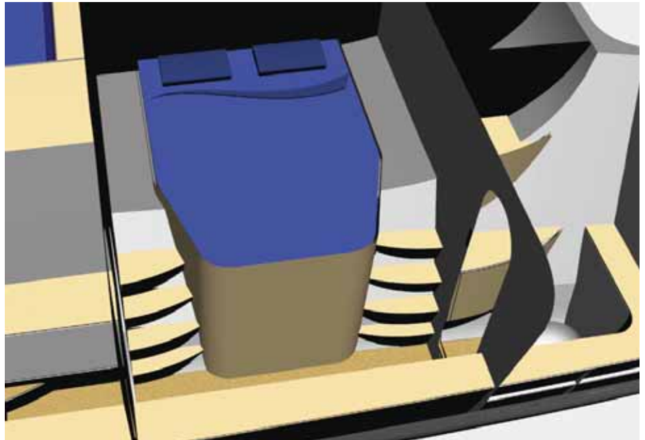
3D view of the island style queen size bunk.

Access into the starboard hull is forward of the galley return, creating a